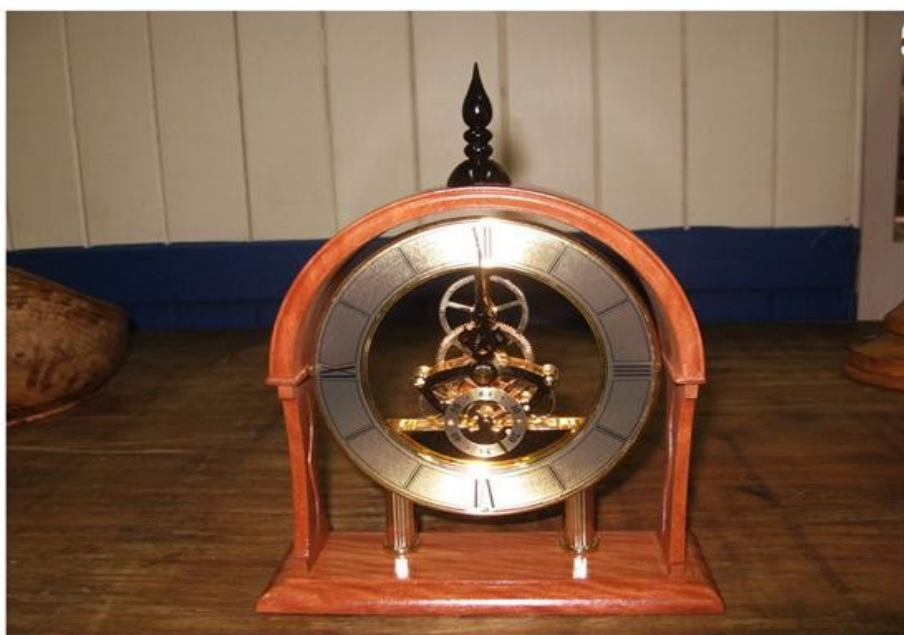
Ron's Clock. 20th. March 2010